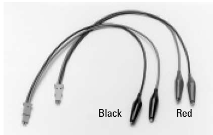
16007A alligator clip lead (red clip) 16007B alligator clip lead (black clip) Alligator clip lead. Cable length, 0.4 meter. Each test lead has a separate alligator clip voltage and current terminal. One lead supplied only.