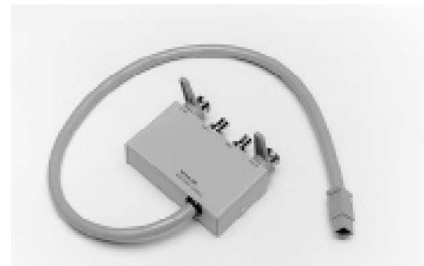
16143B mating cable Interface between test leads and 4338B. Cable length, 0.5 meter.