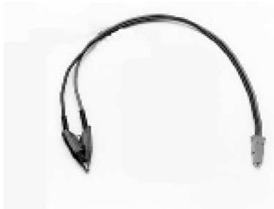
16005B Kelvin clip lead (large) Cable length, 0.4 meter. Jaws mate with large terminal devices. One lead supplied only.