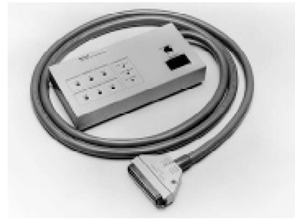
16064B LED display/trigger box Displays comparator status. Cable length, 1.5 meters. External trigger.