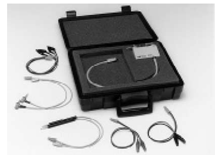
16338A test lead kit Contains one each of the following: 16143B, 16005C, 16005D, 16007A, 16007B, carrying case. Contains two each of the following: 16005B and 16006A.