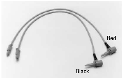
16005C Kelvin IC clip lead (red clip) 16005D Kelvin IC clip lead (black clip) Cable length, 0.4 meter. Small contacts for devices with fine leads. One lead supplied only.