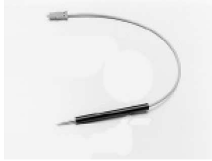
16006A pin-type probe lead Cable length, 0.4 meter. Spring-loaded probe tips for firm contact. Useful for manual contact measurements. One lead supplied only.